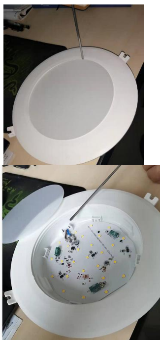
Step 1: Remove the diffuser